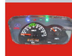
Mono Unit Cluster