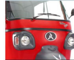
Multi Focal Head Lamp with Halogen Bulb