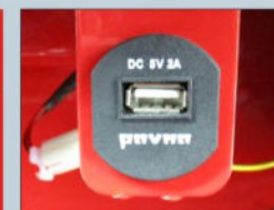
USB Mobile Charger