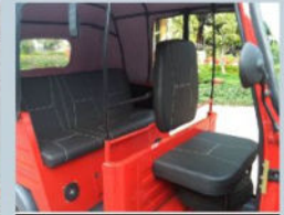
Modified Seat and Cover