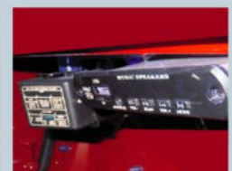
FM Radio System