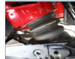
Strong Rear Suspension