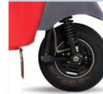
Strong Front suspension